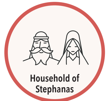
Household of Stephanas